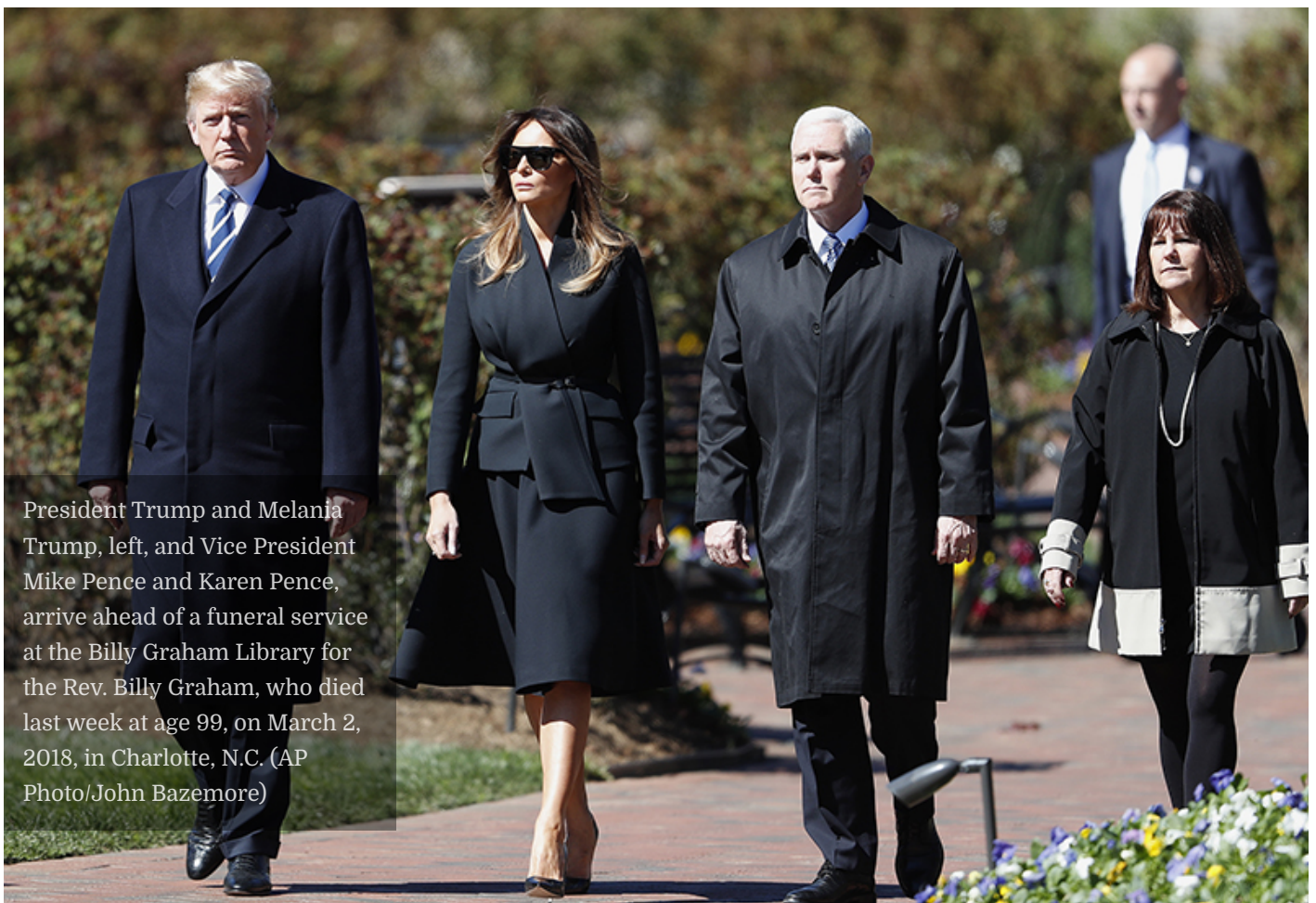
President Trump and Melania Trump, left, and Vice President Mike Pence and Karen Pence, arrive ahead of a funeral service at the Billy Graham Library for the Rev. Billy Graham, who died last week at age 99, on March 2, 2018, in Charlotte, N.C.

“Billy Graham was a bridge-builder,” said Cardinal Timothy Dolan, archbishop of New York, speaking to reporters before the funeral. “Back in the late 1940s and 1950s, to have welcomed Catholics, to embrace them, that wasn’t always accepted. He did it well. So I am honored to be here as a representative of the Catholic faith in the United States.”