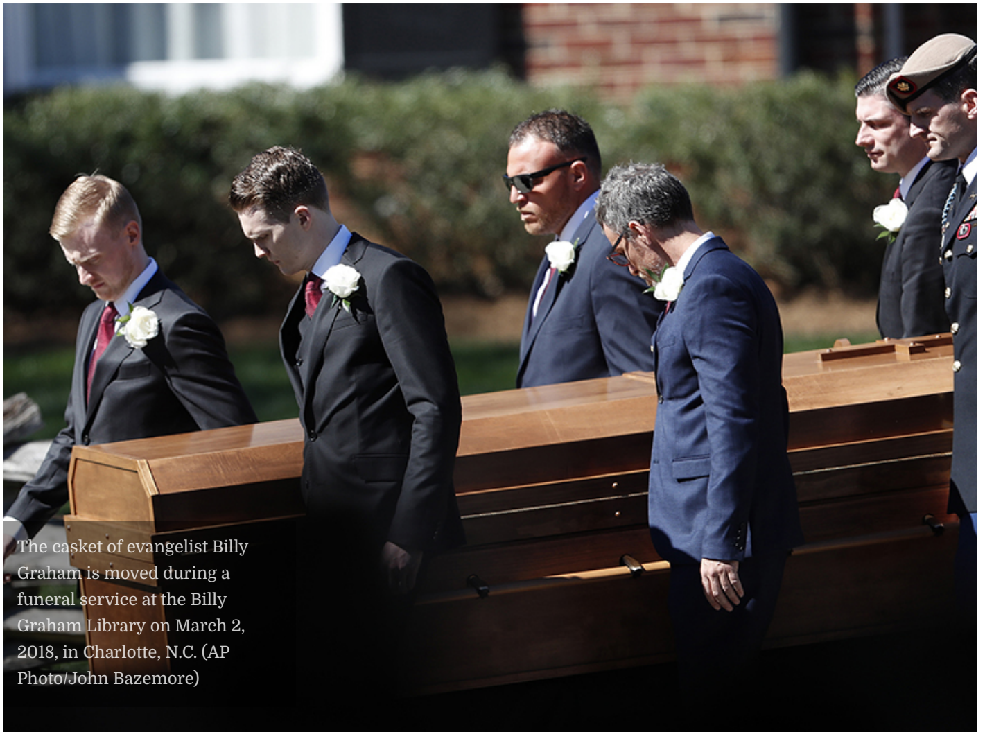
The casket of evangelist Billy Graham is moved during a funeral service at the Billy Graham Library on March 2, 2018, in Charlotte, N.C.

CHARLOTTE, N.C., (RNS) — With his childhood home as a backdrop, Billy Graham was celebrated as a man of God at a his funeral, the closing chapter of a century-long story in American evangelical history.